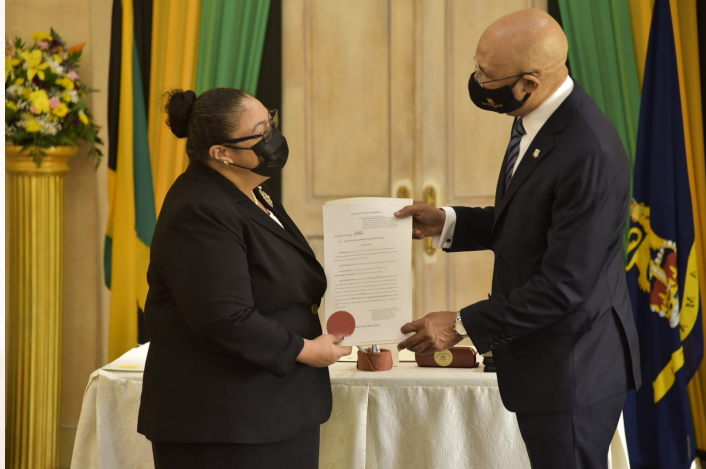
PHOTO HIGHLIGHTS - SWEARING-IN CEREMONY