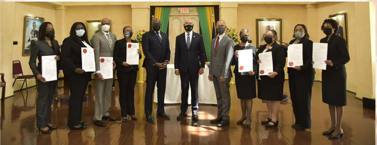
PHOTO HIGHLIGHTS - SWEARING-IN CEREMONY