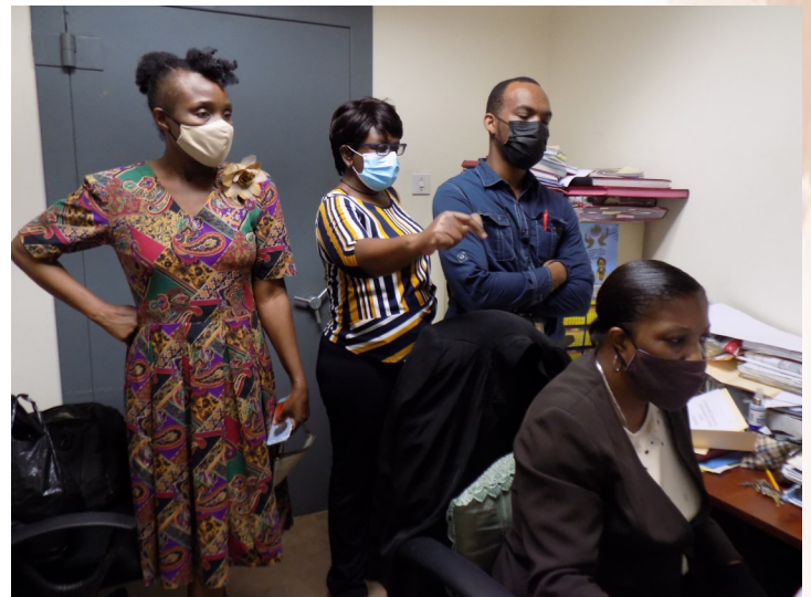
Members of the Finance and Accounts Division at CAD with their colleagues at the Portland Parish Court during the implementation of GFMS at the court on March 12, 2021.