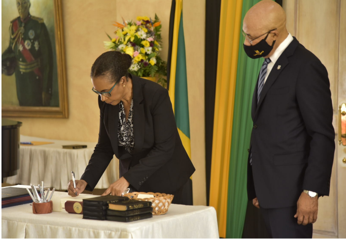
PHOTO HIGHLIGHTS - SWEARING-IN CEREMONY