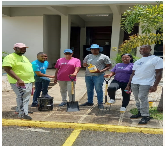
The hardworking team from the Chapleton Family Court pose for a quick photograph after a day of teamwork.