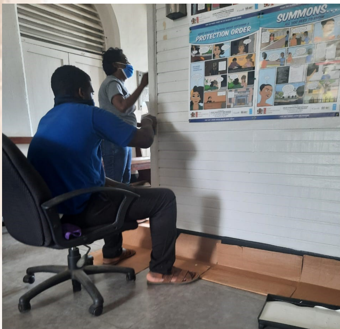
A male staff at the St. Elizabeth Parish Court paints a section of the Court during the Labour Day activities.