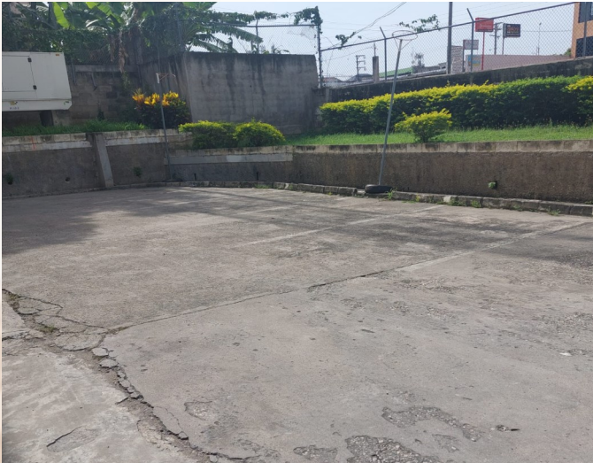
A before photograph of the parking space of the St James Parish Court.