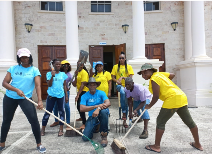
Team Portland poses for a group photo brightly attired in blue and yellow after completing their clean-up on the day of the exercise.