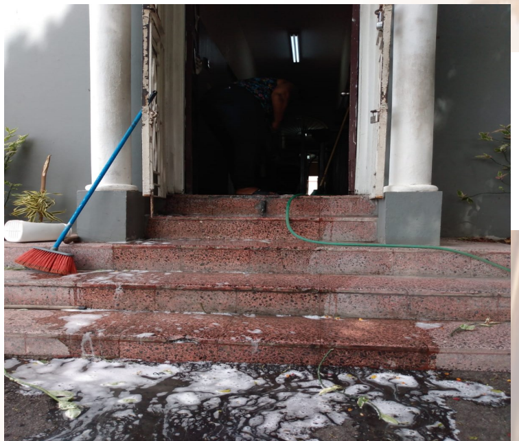
The steps to the entrance of the Traffic Court is being scrubbed and washed on Labour day.