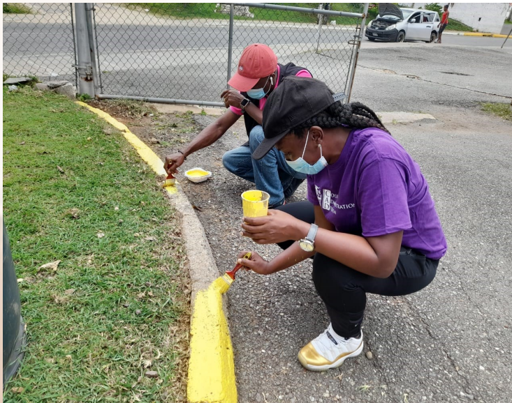
Staff members paint the curb wall of the parking stalls at the Chapleton Family Court in Clarendon on Labour Day.