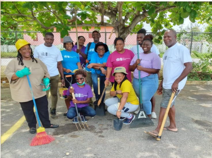
Group of participants from the Hanover Parish Court who joined hands together in beautifying the court on Labour Day.