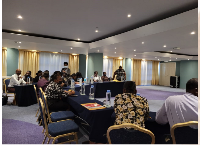
Customer Service Training in session at Four Seasons Hotel in St. Andrew on May 30, 2022.