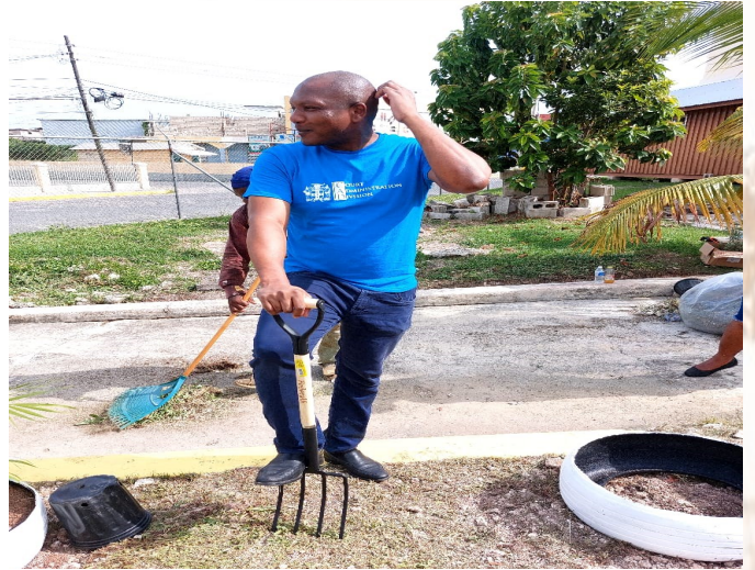
A male staff takes a rest while ploughing the soil for grooming during the Labour Day exercise.