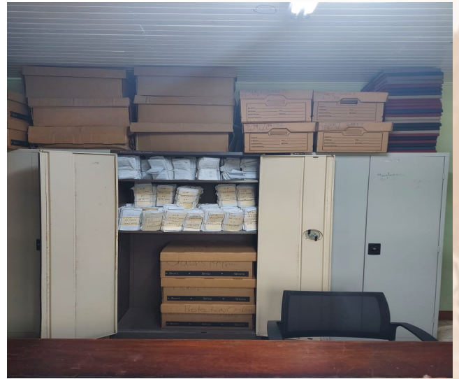
Files have been placed in boxes and neatly stored for a more organized storage at the Westmoreland Family Court.