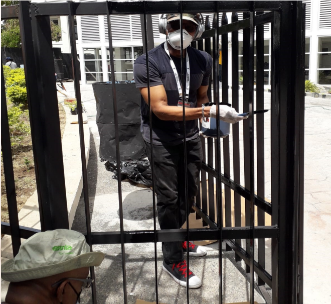
Male staff paints grill to the main entrance of the Court of Appeal on Labour Day.