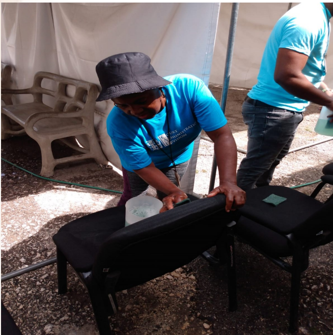
A seat is being scoured by a female staff at the Traffic Court.