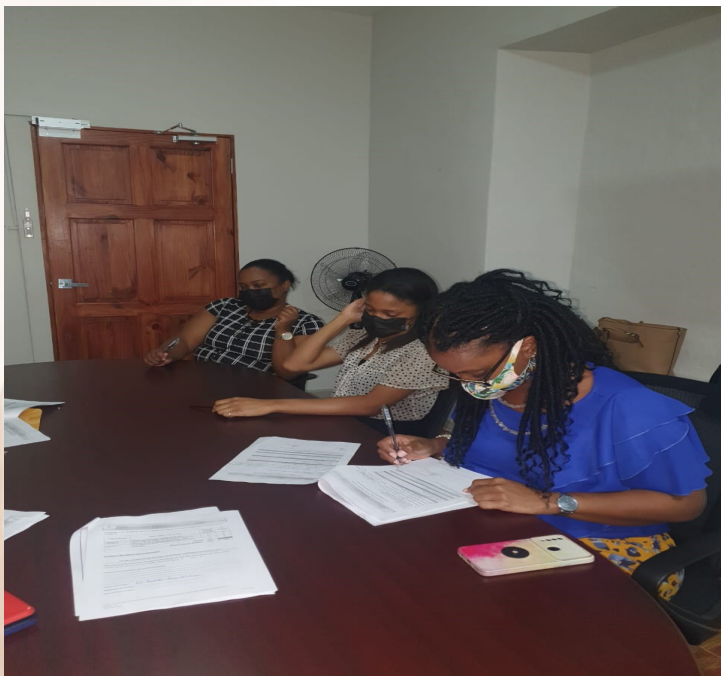
Participants from the Manchester Parish, Manchester Family and Clarendon Parish Courts engage in group discussion during Customer Service Training session held at the Four Seasons Hotel on May 30, 2022.