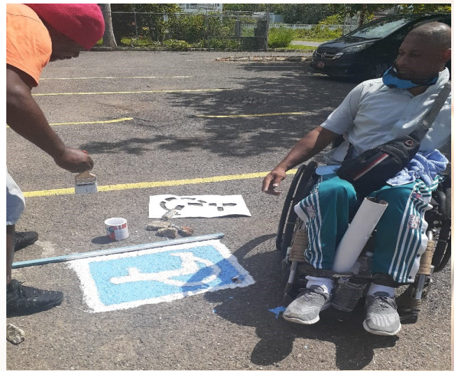
The section for the disabled of the Court's parking lot is being painted by a staff member while another looks on.