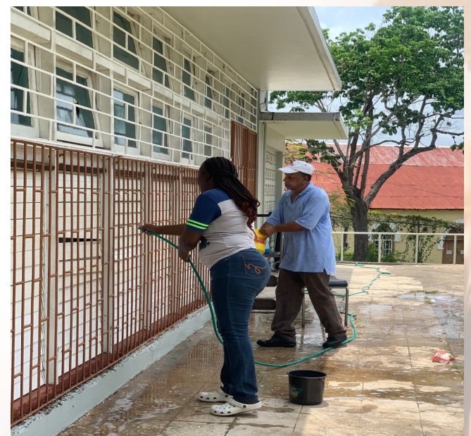
The grills of the St. Catherine Parish Court are being washed by a male and a female staff member during the exercise on Labour