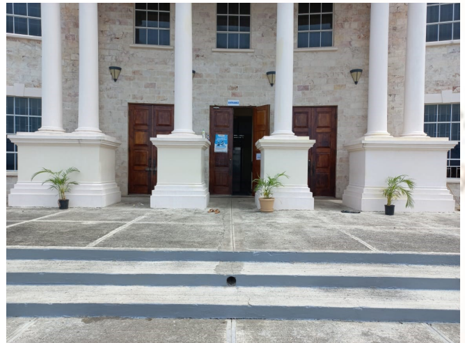
The front of the Portland Parish Court after it's make-over.