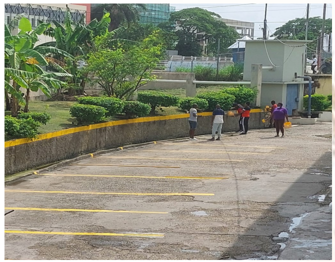
The St. James Parish Court parking lot after it was painted on Labour Day.