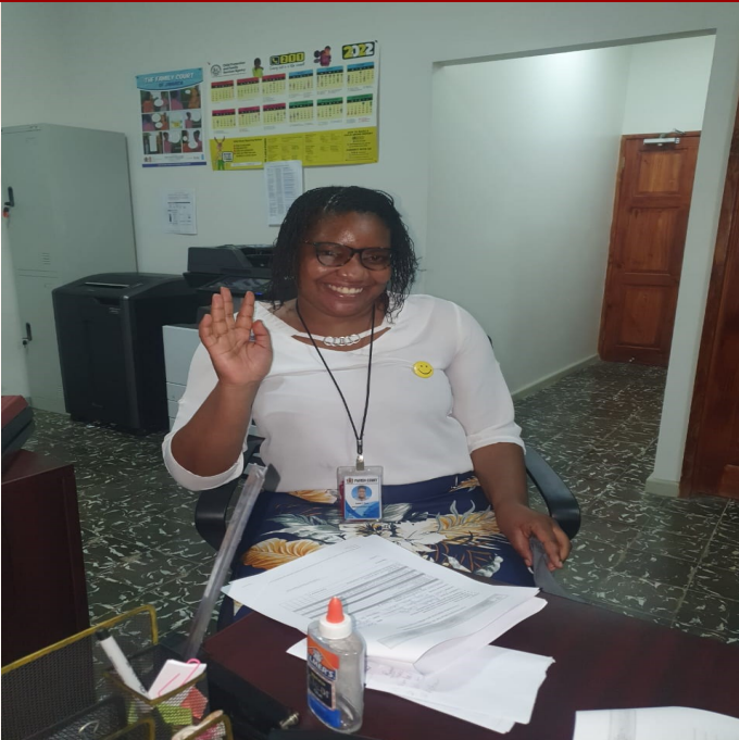
Assistant Clerk of the Court from the Manchester Family Court pauses for quick photograph during her assessment.