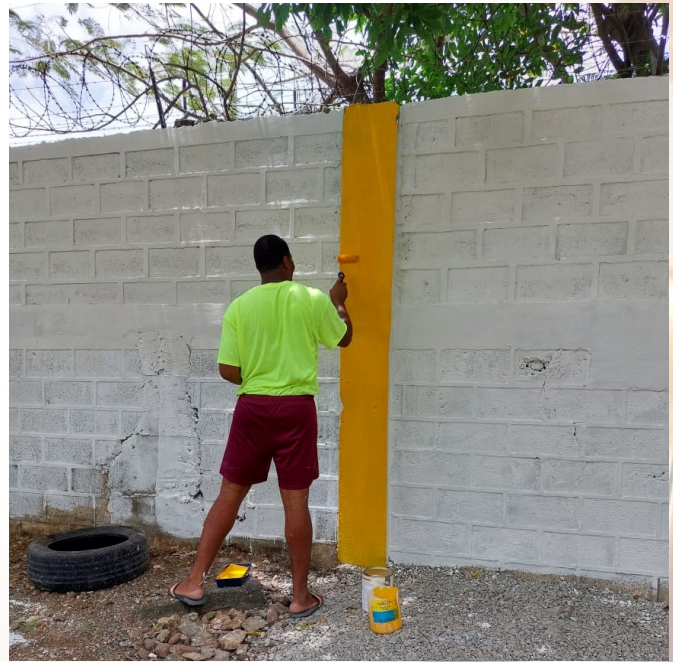
A little splash of yellow is being added by a male staff to brighten things up!