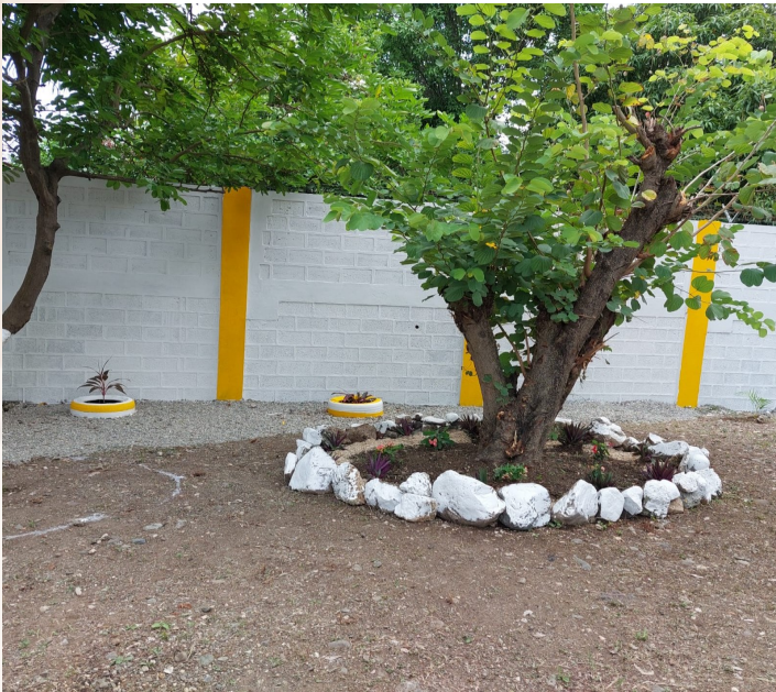
A beautifully groomed tree with white-wash that was done by staff members at the Hanover Parish Court on Labour Day.