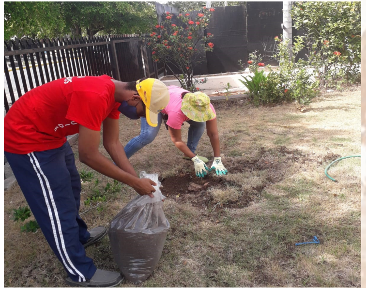
A section of the court yard is being prepared for the planting of flowers by a male and a female participant.