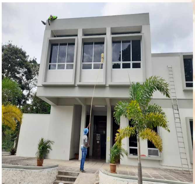
A staff uses a long broom to clean the front section of the St. Elizabeth Parish Court.