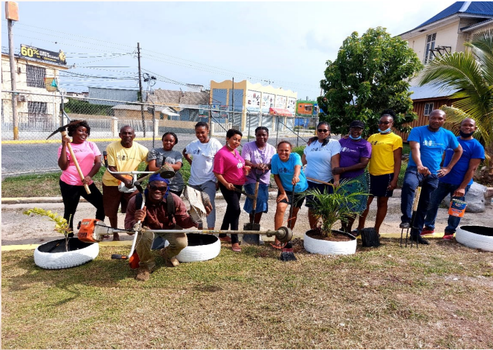
Team from the west! Participants soaking up the sun after a day of teamwork at the Westmoreland Parish Court.