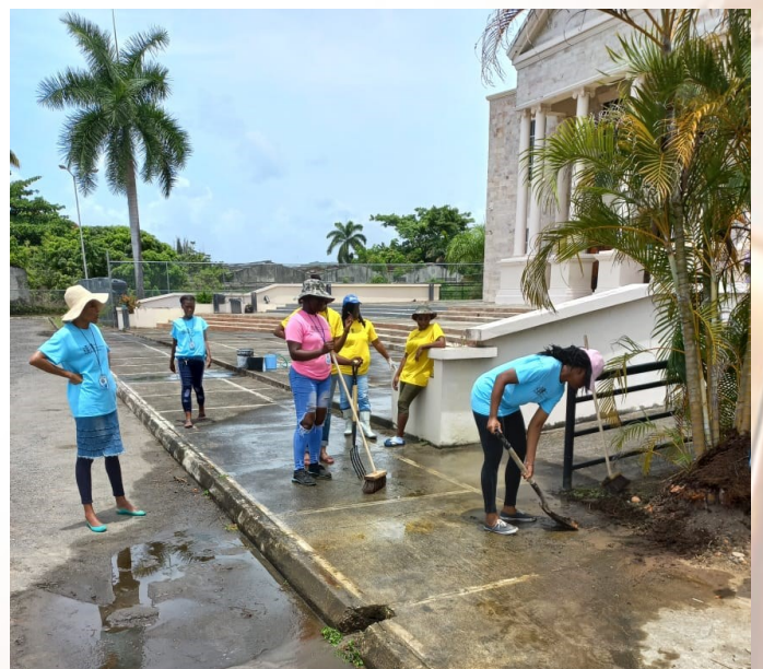
Staff members are hard at work during the Labour Day exercise at the Portland Parish Court.