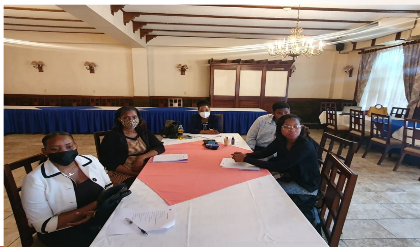
A group from the western region listens attentively during training session.