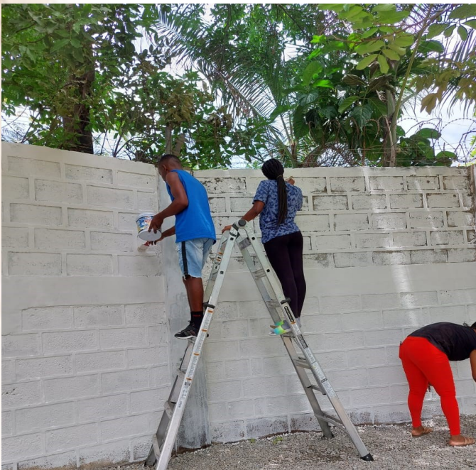
Team St. Thomas paints the wall of the Court on Labour Day.