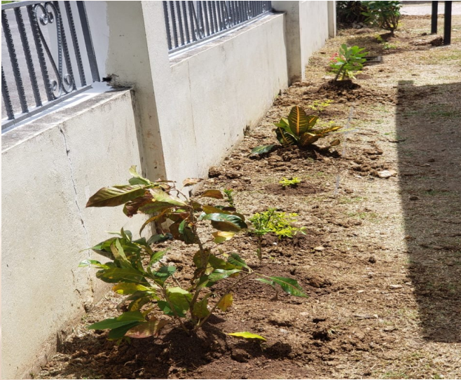
Participants from the Westmoreland Family Court planted crotons along the side of the court yard.