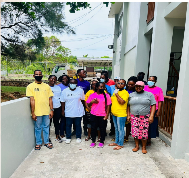
The St. Catherine team poses for a group photograph after a day of teamwork on Labour Day.