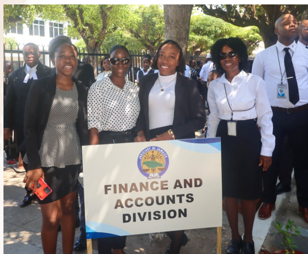
Staff from the Finance and Accounts Division of CAD pause for a photo at the Judiciary Day civic ceremony