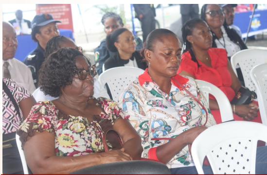
Residents in attendance at the Public Education Day Symposium's Civic Ceremony