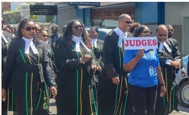
Judges of the Supreme Court during their Judiciary Day march