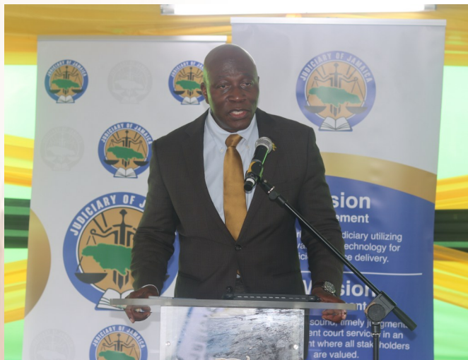
Chief Justice, the Honourable Mr. Justice Bryan Sykes, OJ, CD, delivering remarks at the Portland Parish Court Public Education Day.

The Portland Parish Court opened its doors for the Judiciary of Jamaica's quarterly Public Education Day Symposium on May 27, 2025. Under the theme, "Judiciary at Work: Educating, Engaging and Empowering," the residents of Port Antonio and surrounding communities welcomed the opportunity to directly engage with the judiciary of Jamaica. Despite intervals of rain throughout the day, the Portland Parish court transformed into a vibrant domain for learning, dialogue, and community connection.