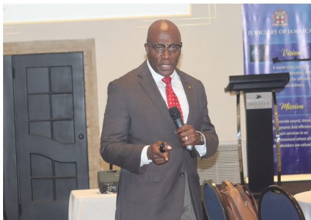
Chief Justice, the Honourable Mr. Justice Bryan Sykes, OJ, CD, presenting on Performance Measurement and Management.

The Chief Justice closed by thanking the judges and staff, noting that court excellence scores have shown modest improvement, with leadership and data management identified as priority areas. He urged all to keep improving case management, work towards clearing backlogs, and embrace digital tools.