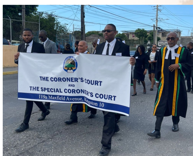
The Coroner's Court and the Special Coroner's Court taking on the road for their Judiciary Day march