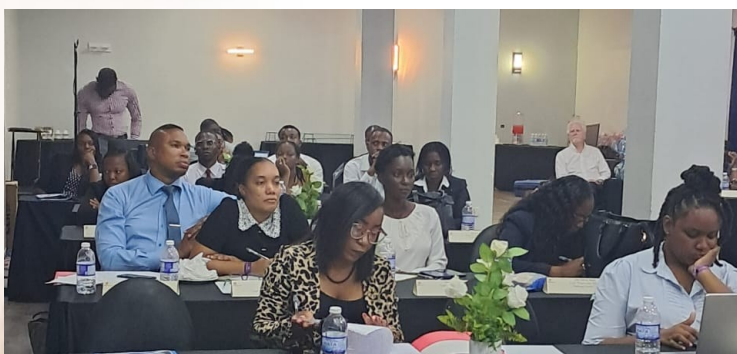
Case Progression Officers gearing up to thrive, execute and excel

In a decisive move toward greater efficiency and service excellence, the Judiciary of Jamaica hosted a dynamic four-day training retreat for Case Progression Officers (CPOs) from May 27–30, 2025. The training brought together over 50 officers and stakeholders under the empowering theme: “Thrive, Execute, Excel. Defining the Case Progression Officer Path for Efficient Case Management.”