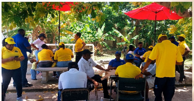
Staff of the Hanover Parish Court pause for a well-deserved break during Labour Day activities.