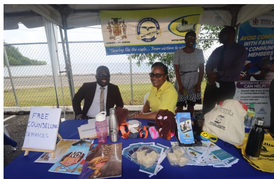
Ministry of Justice's Victims Services Division engaged at their booth