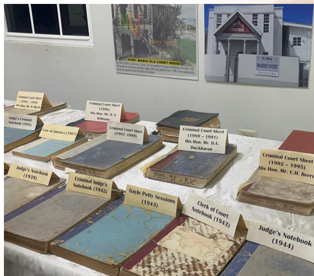
Judiciary Day "Historical Corner" at the St. Mary Parish Court