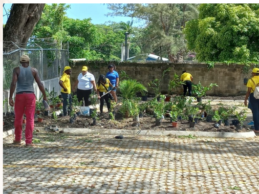
Staff of the St. Catherine Parish Court tilling and pruning on Labour Day