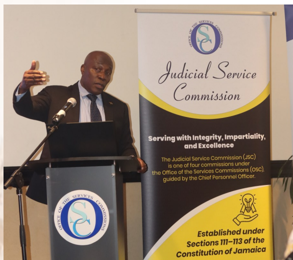
Chief justice bringing greetings at the Judicial Service Commission Retreat

The Judicial Service Commission (JSC) convened a strategic three-day retreat on May 16, May 17, and June 13, 2025 at the Pegasus Hotel, aimed at reinforcing the Commission's commitment to integrity, efficiency, and transparency in Judicial administration. This forum provided an opportunity for Judicial leaders to engage in thoughtful discourse on key initiatives essential to the advancement of the nation's legal framework.