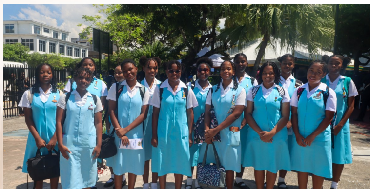
Students from the Wolmer's Girls School in attendance at the Judiciary day celebration