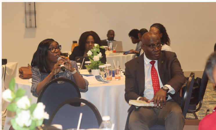
The CEO/Director of CAD and Chief Justice pictured during the commission.

Senior Judges united to strengthen justice and chart the way ahead for the Parish Court Commission on Friday, April 25, 2025, at the Jamaica Pegasus Hotel. The event shone a light on the determination, teamwork, and problem-solving that continue to advance justice delivery across Jamaica's Parish Courts. The workshop aimed to equip judicial officers and legal practitioners with a deeper understanding of the operations of the parish courts; specifically, case backlog reduction.