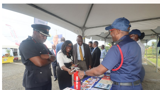
Chief Justice and Director/CEO of CAD learning and connecting with the Jamaica Fire Brigade