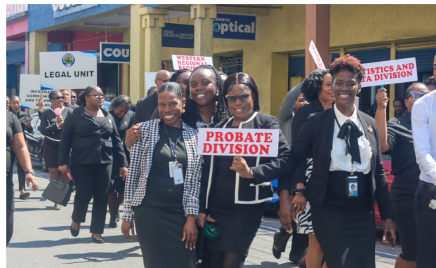
Staff from the Probate Division pause for a photo during their Judiciary Day March