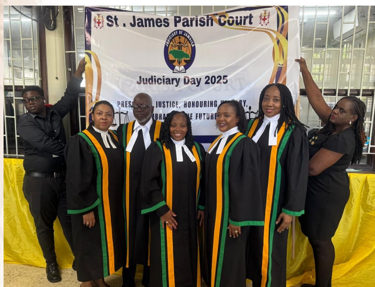
Judges and staff of the St. James Parish Court pauses for a photo during their Judiciary day activities