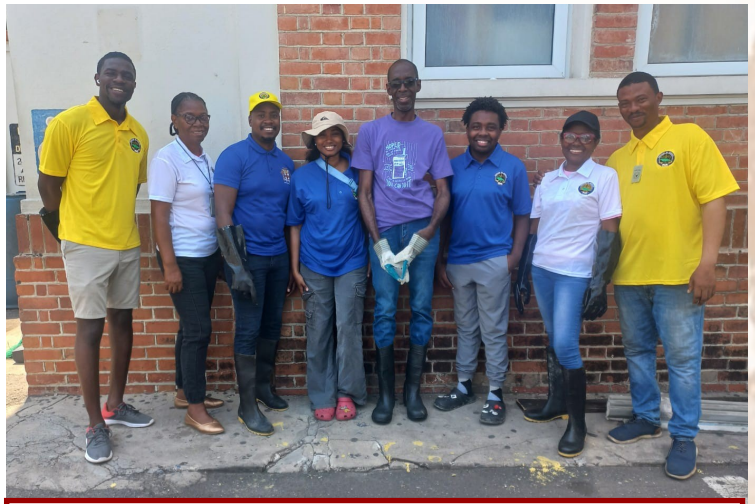
Staff of the Kingston & St. Andrew Parish Court (Criminal Division) pause to take a photo amidst their Labour Day activities