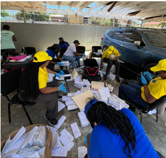
Trelawny Parish Court "Legal Eagles " hard at work