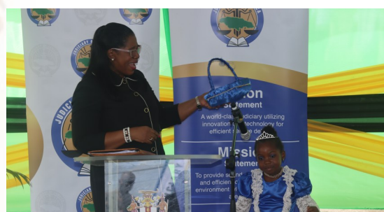
President of the Court Appeal engaging with young talent from the Portland Dance Troupe